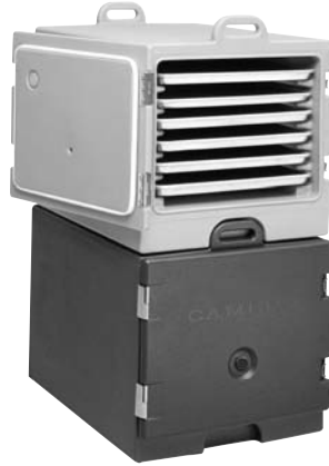
For Camcarrier 1826MTC (Camcarrier for Trays & Sheet Pans)